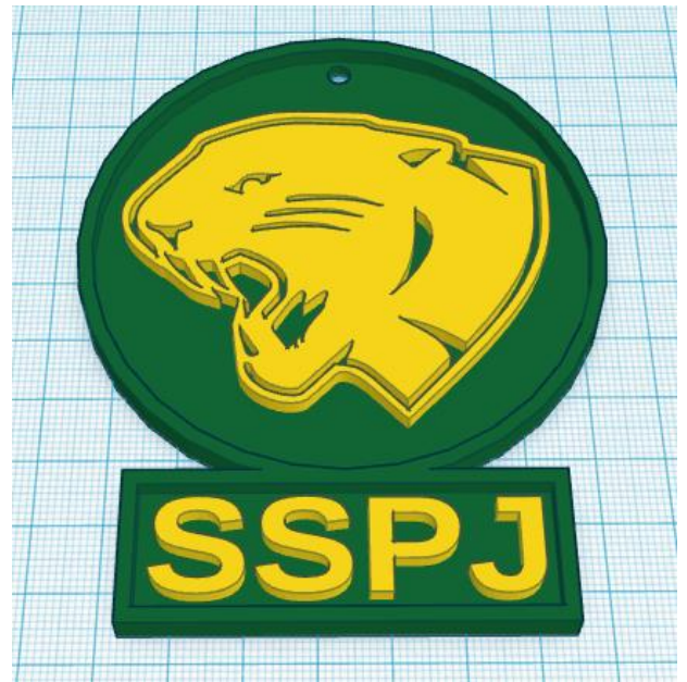
Christmas Tree Ornament made by the students.