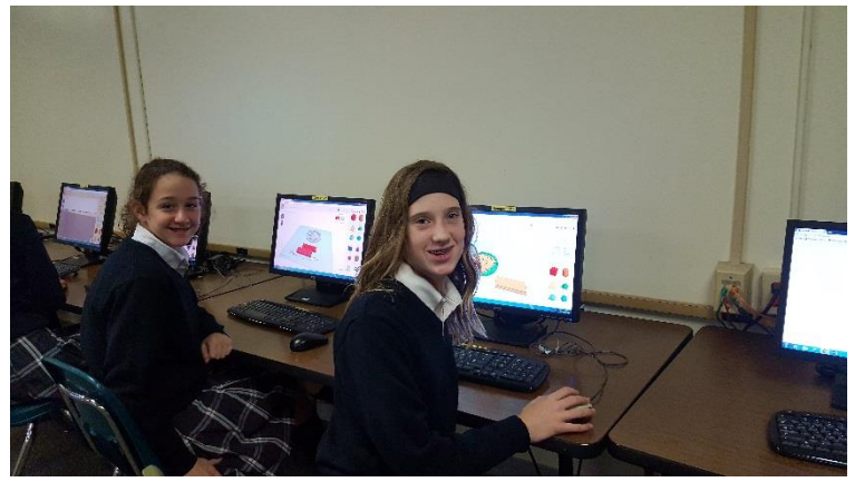
3D Design and Printing Workshop